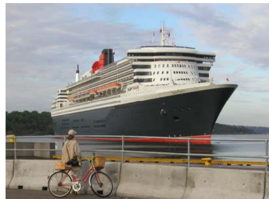
Queen Mary II on an early morning arrival in Oslo.

For 2007 144 cruise vessels have so far announced their call at Oslo.