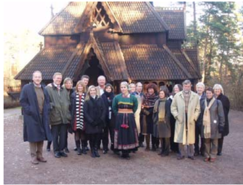
The network participants in front of the Stavechurch in the Norwegian Museum of Cultural History.